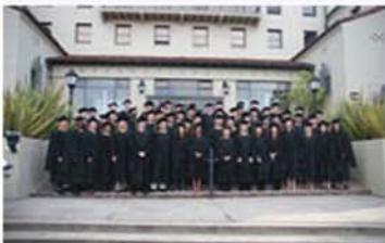
IEA Graduation 2004