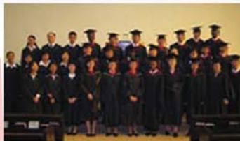
IEA Graduation 2005