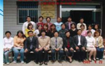
IEA Graduation 2005 Shanghai Labor College